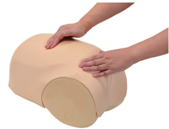
Palpation of uterine fundus