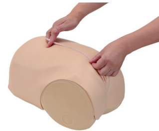
Measurement of fundal height